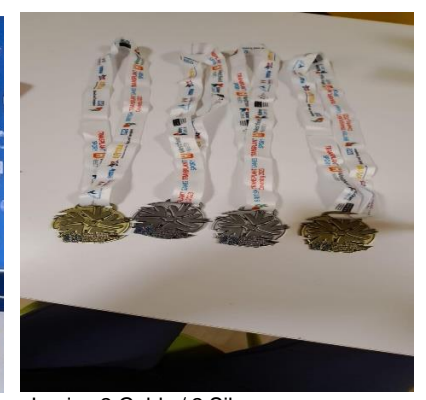
Louise - Swimmin